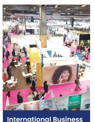
Promotion Targeted international missions / exhibitions linking customers with suppliers