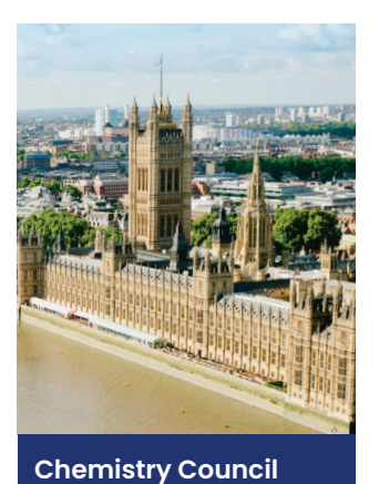
Long-term joint industry / Government partnership to deliver UK Growthh