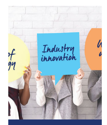
ChemTalent Early Careerists' Network