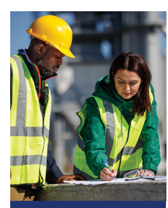
Sector and Professional Groups / Networks

Includes HF, Sulphuric Acid, Isocynates, Chlorine and Biocides