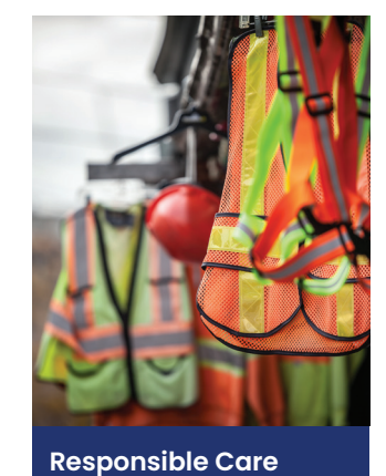
Chlorine Covenant, Process Safety Management, Critical National Infrastructure focus, Responsible Care Verification

Includes HF, Sulphuric Acid, Isocynates, Chlorine and Biocides