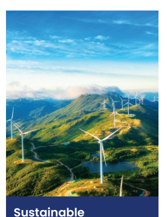
Development Strategy Group established to advise on CIA role and industry actions